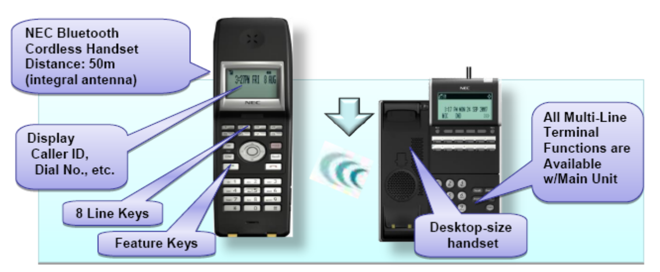
DTL-12BT-2 (BK) TEL and BCH-L (BK) UNIT

The Bluetooth functionality is only supported on the DT330 terminals. The Bluetooth handset functionality comes with integrated Bluetooth hub. When this adapter is installed on the DT330 it will acquire both ports 1 and 2 of the terminal.